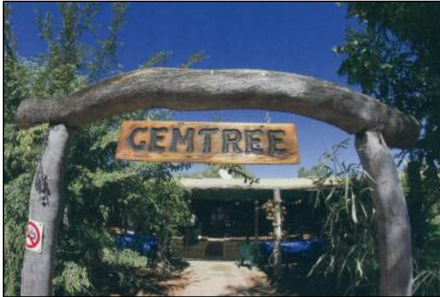
"Gemtree" on the Plenty Highway 150km from Alice Springs – location for a one hour lunchbreak on the Tuesday