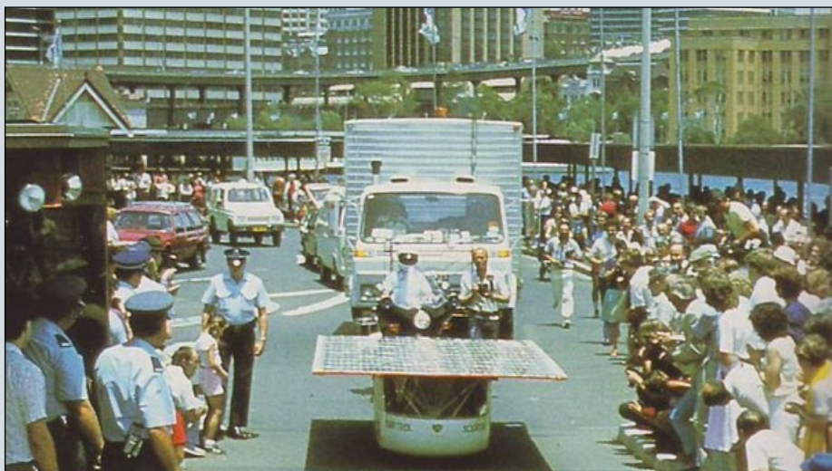
Arrival of the Quiet Achiever at the Sydney Opera House at the end of its 4000km journey

What have I been doing - well, being in Lockdown Mode in Melbourne my time has been spent writing up a history of my time of involvement at Targa Tasmania (1993-2003) and Classic Adelaide (2002-